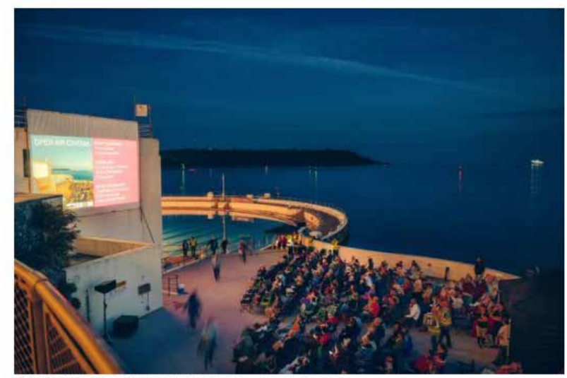
Tinside Lido's Open Air is back this summer

After a refreshing dip in the lido, why not hang around at the site and stay to watch a film?