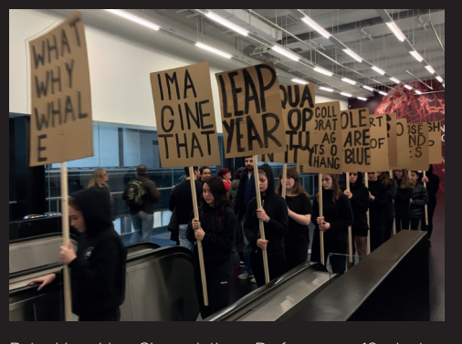
Peter Liversidge, Sign paintings, Performance, 12 minutes 32 seconds, Tate Modern April 2016.

Plymouth Arts Centre is a nationally acclaimed centre for contemporary art, independent cinema and creative learning. It commissions work by national and international artists, working with them to develop challenging and varied exhibitions complimented by our dynamic independent cinema programme.