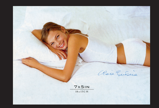
Claire Fontaine. Copyright: Studio Claire Fontaine Courtesy of Claire Fontaine

The Council House is a key example of late-1950s British Modernism located in the heart of Plymouth's city centre, and a permanent reminder of the ambitious scheme to rebuild and regenerate the city after the devastation of the Blitz during the Second World War.